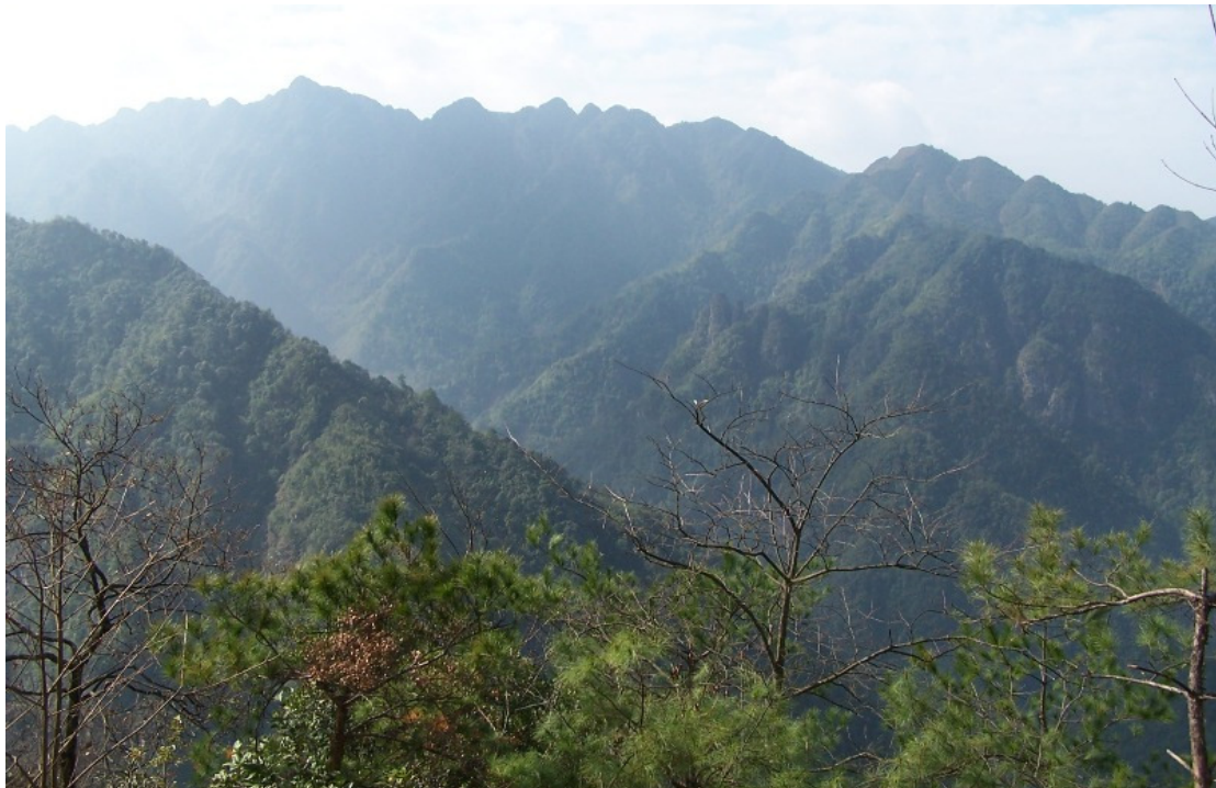
Dayao Shan (CN475) was one of the first sites where ornithological research was conducted in mainland China, and in addition to the birds it supports many rare wild animals.

Key: ● = Protected; ● = Partially protected; ○ = Unprotected.