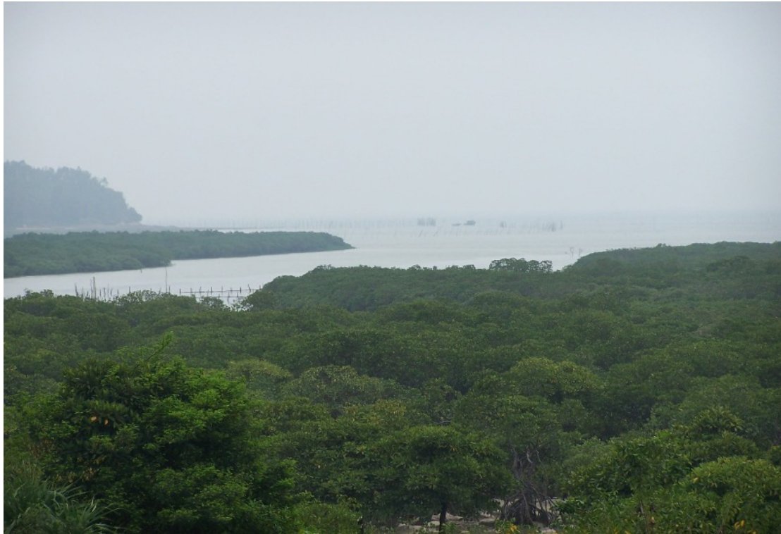
Shankou Mangroves Nature Reserve (CN487) is designated as a 'Wetland of International Importance' (or Ramsar site) and is a wintering site for threatened bird species such as Black-faced Spoonbill Platalea minor .